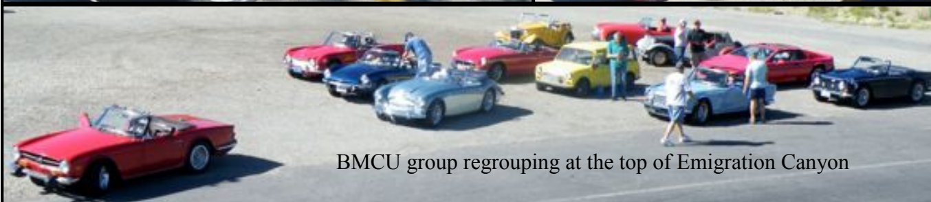
BMCU group regrouping at the top of Emigration Canyon