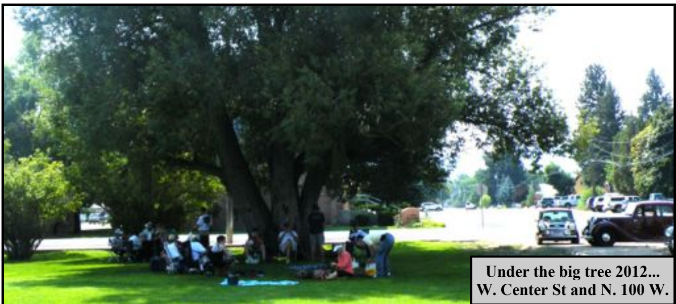
Under the big tree 2012... W. Center St and N. 100 W.