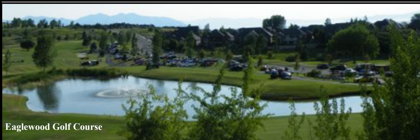
Eaglewood Golf Course