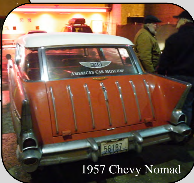
1957 Chevy Nomad

2WD's from the 60's heading cross- country; just like back when.