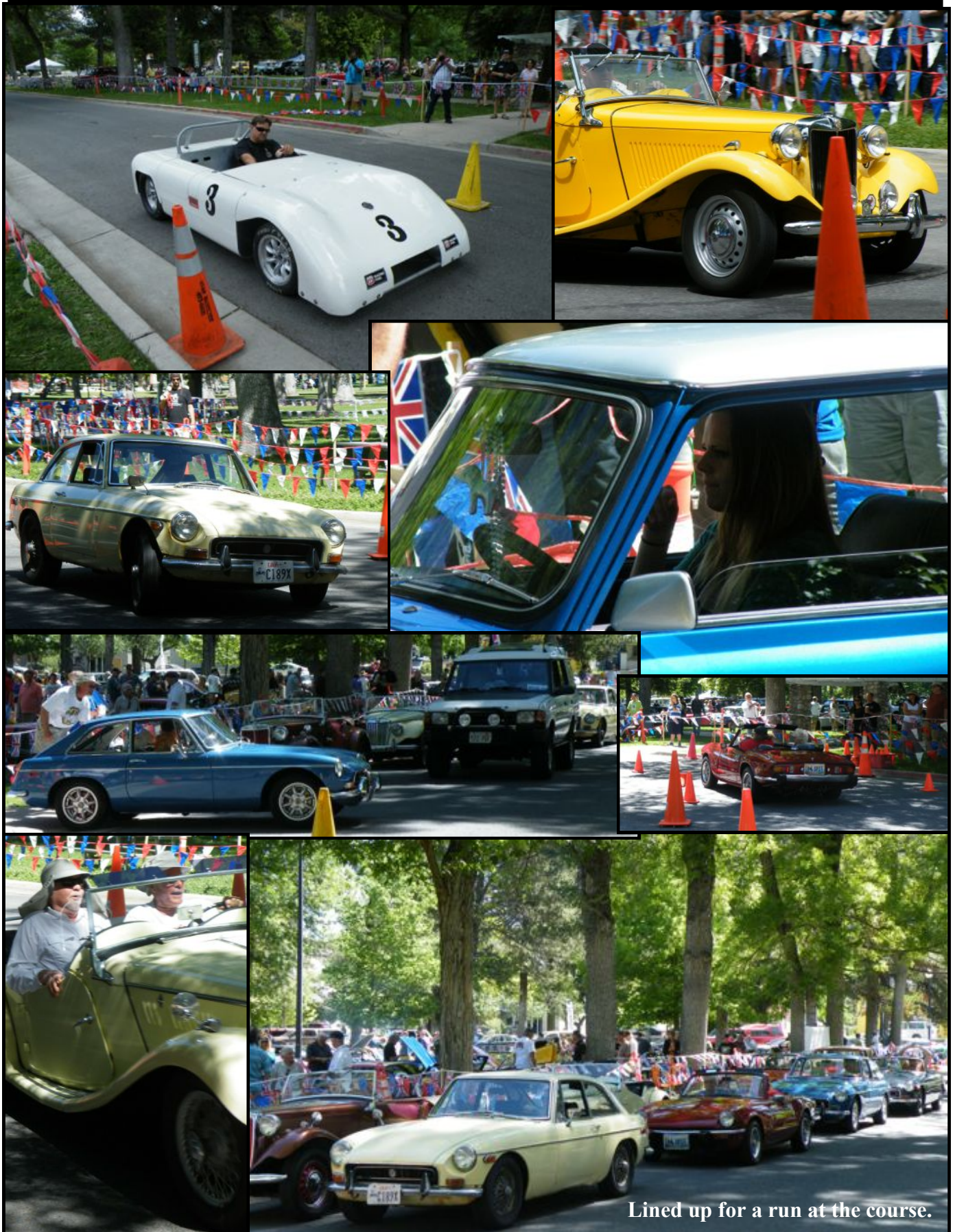
Lined up for a run at the course.

Page 6 BFD Committee members and other volunteers make it happen.