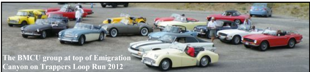
The BMCU group at top of Emigration Canyon on Trappers Loop Run 2012

All are invited to the free Eaglewood Festival of Speed Tuesday July 2 in North Salt Lake.