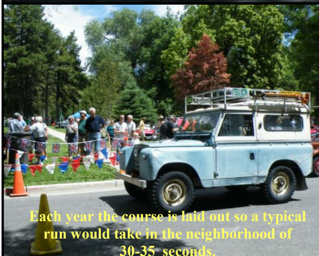
Each year the course is laid out so a typical run would take in the neighborhood of 30-35 seconds.