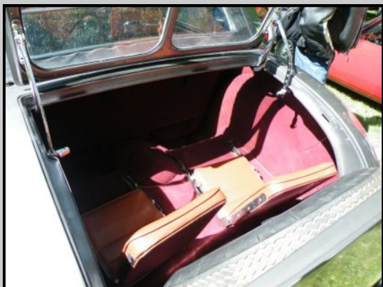
1948 TRIUMPH 2000