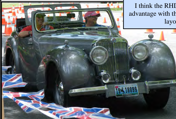
I think the RHD folks had an advantage with this year's course layout!