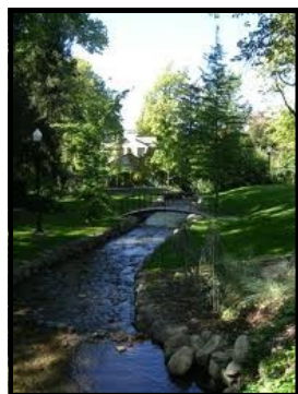
Red Butte Creek flows through it.