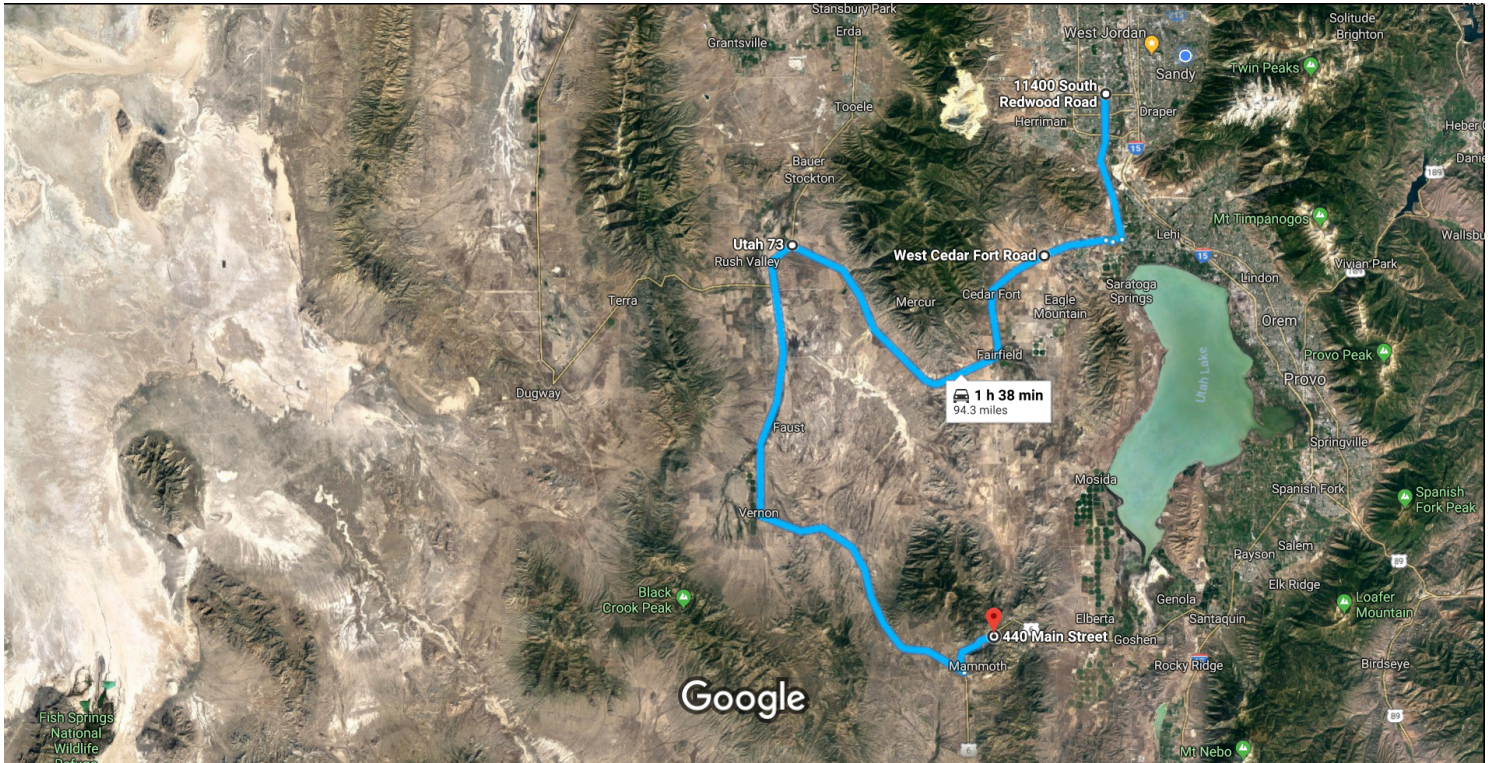
5 mi