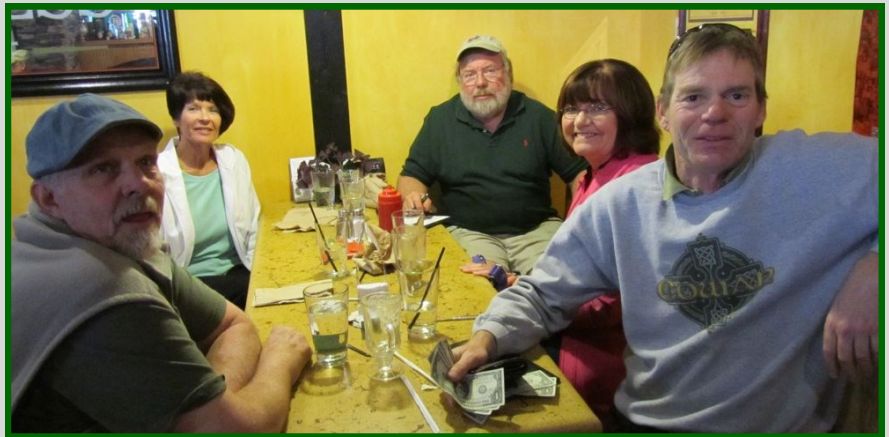
LBCs like to dress up with some green too.