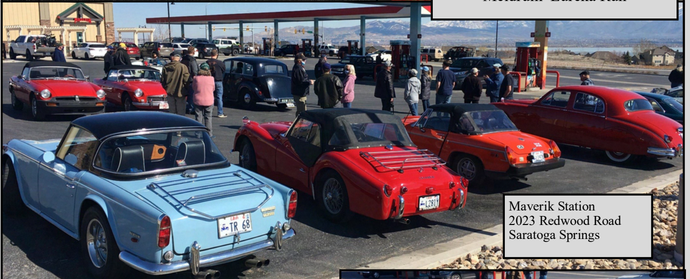
Maverik Station 2023 Redwood Road Saratoga Springs

The weather in March is always a challenge to predict. Rain, then sun, then snow, then temperatures up and down the thermometer make planning an outdoor event tricky at the best. The BMCU has a way to avoid all the stress of the weather. We don't worry about it! lol