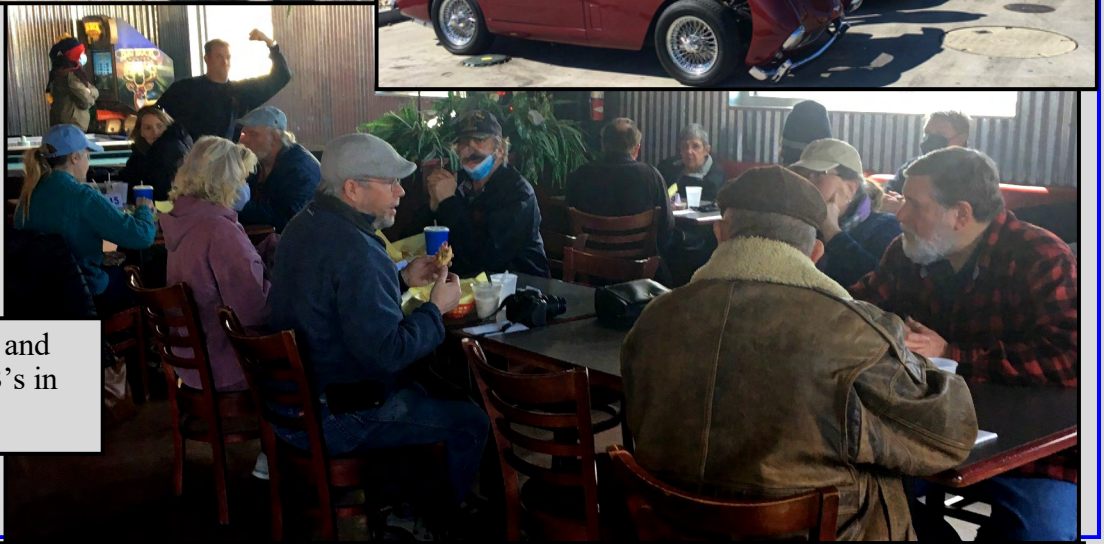
Good food and service at B's in Eureka