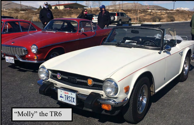
"Molly" the TR6