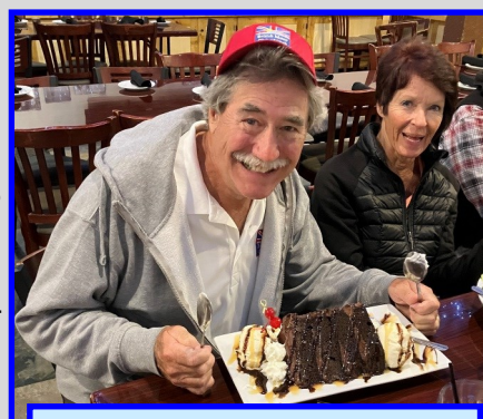
The whole table enjoyed this dessert.

Monday's dinner, when the temperature dropped too low for a patio meal, Kent arranged for exclusive use of a dining room. After lots of laughter and stories it was time for dessert. All I can say is, ask one of the Extra Day folks about the humongous, seven-layer, chocolate cake and ice cream.