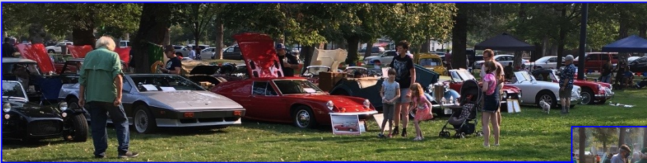
Just a few of the British vehicles from last year's BFD