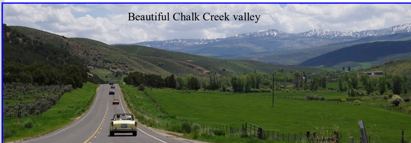
Beautiful Chalk Creek valley