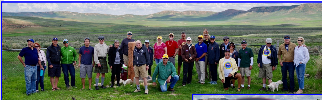
Some folks ate in UT others were in WY