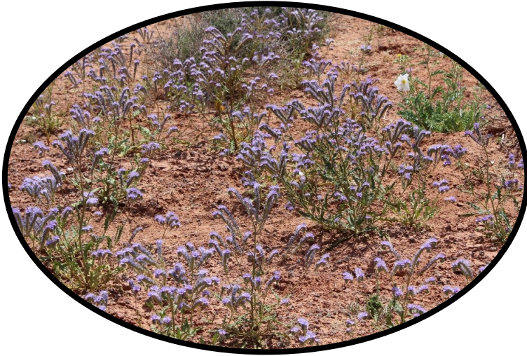
Wildflower superbloom in SE Utah