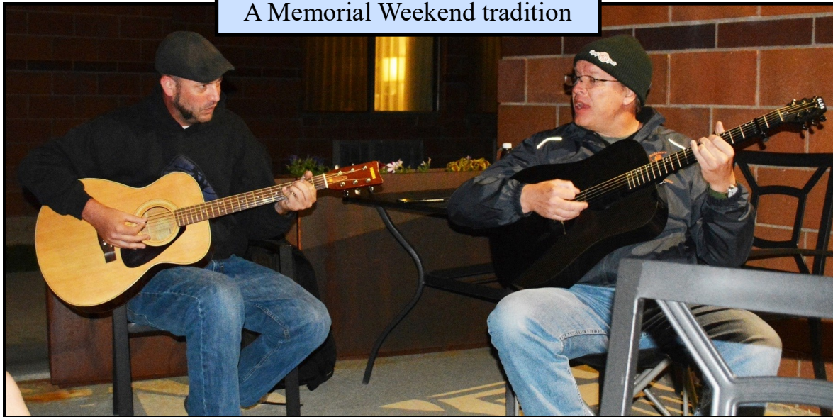
A Memorial Weekend tradition